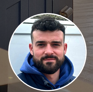
JJ / Carpenter / Joiner